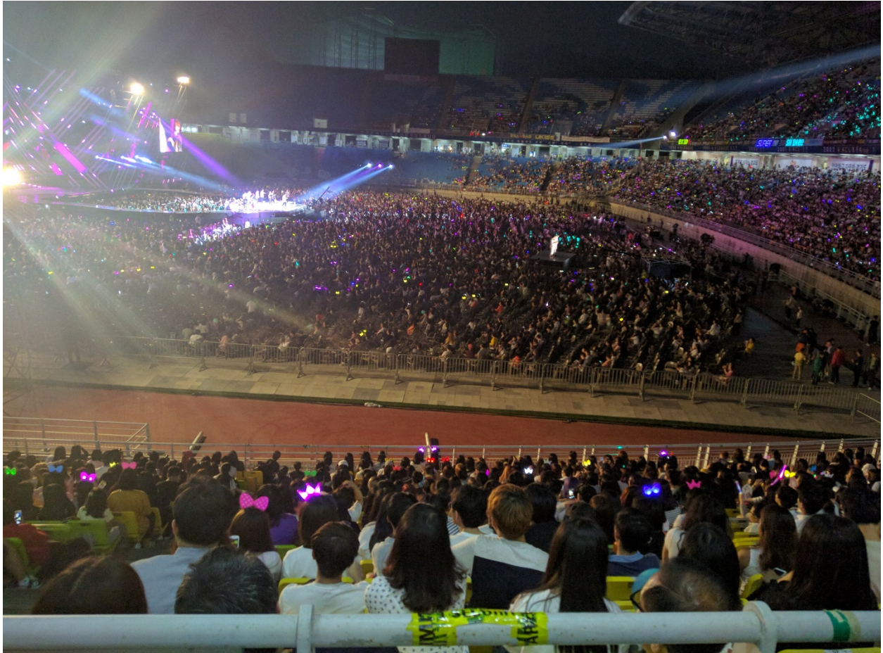
Suwon Super Kpop Concert, Suwon World Cup Stadium, Seoul, South Korea