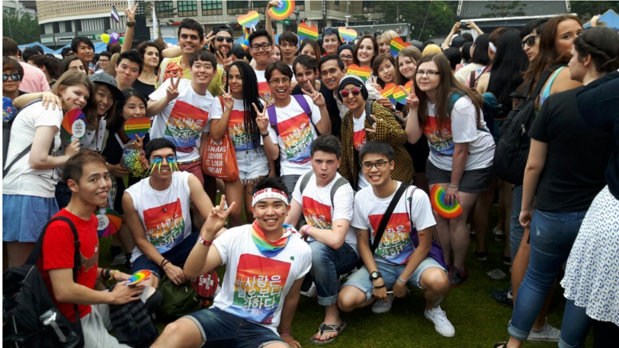
Seoul Pride 2016: Seoul City Plaza 5/12 with P2Pi