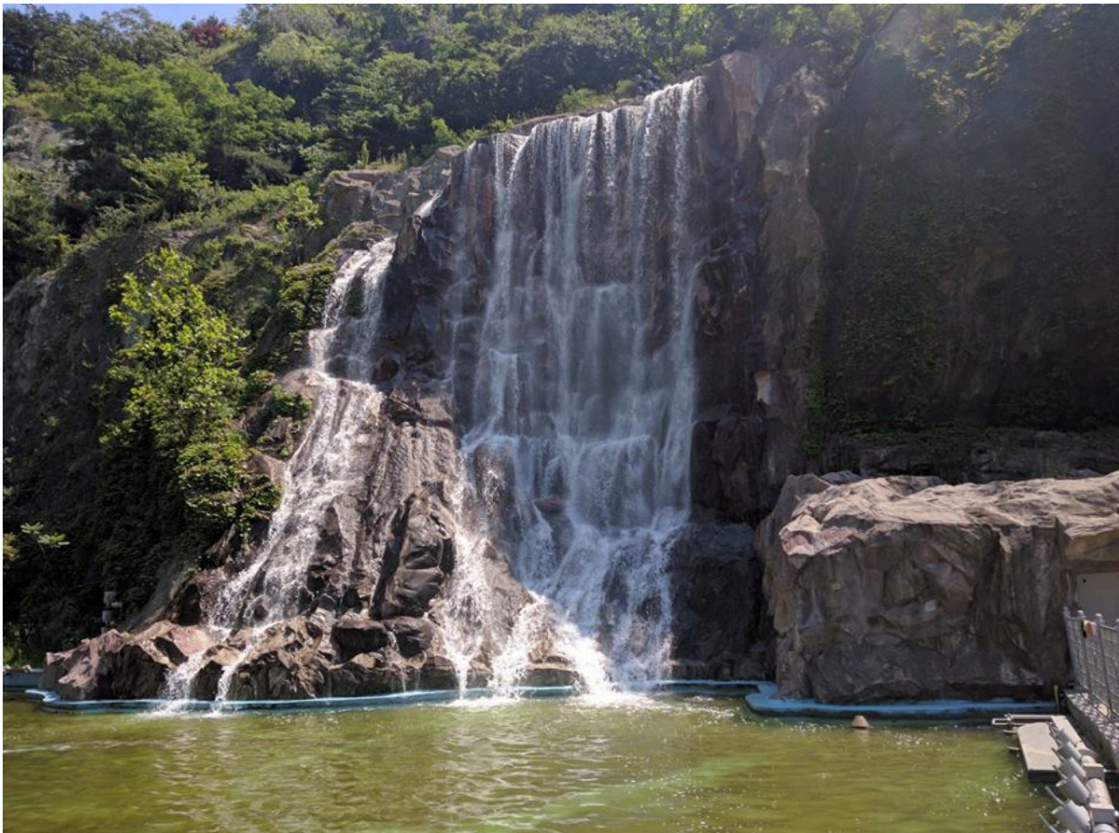
Waterfall at the base of Mt. Ahasan, Gwangjin-gu, Seoul, South Korea

I plan to continue studying Hangul/ Korean, so I can return to Seoul in the future, preferably after I graduate. In a way, learning Hangul also helped me to improve my Chinese after being immersed in a country with a significantly high Chinese population. In the sense of academia, the passion, knowledge and insights I gained had helped me decide that I really do want to pursue a career in Ecology and Ecological research. Personally, studying abroad made me go head first into new situation, ripping me out of my comfort zone and allowed me to grow as a person. In the end, my time was well spent in Seoul and I wouldn't trade it for anything else as I do believe I came out of it a new person with a more optimistic outlook on life. I may have accomplished my original checklist, but after travelling and living abroad I have many more events/ experiences I look forward to. Thanks to my parents, UMass Boston's amazing Study Abroad Office, Gilman's Scholarship and Korea University for giving me the chance to live abroad and to the many friendships and bonds created for making it worth it.