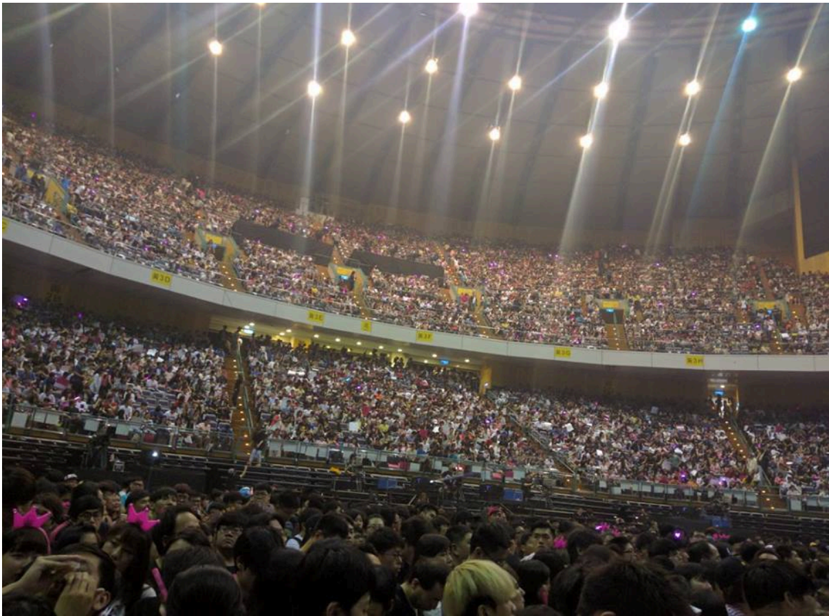
Girls Generation Concert, Taipei Arena, Taipei, Taiwan