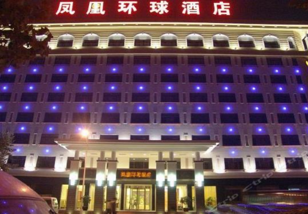
Student Resident Hotel