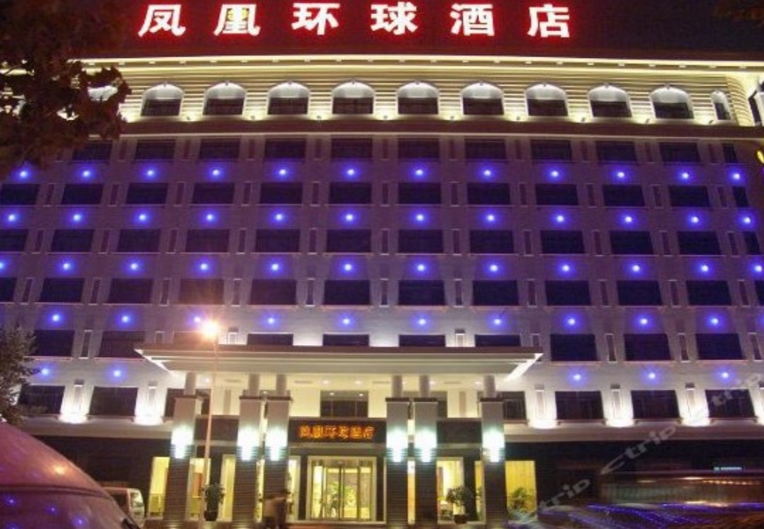
Student Resident Hotel