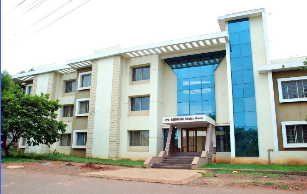
BVB DESHPANDE SCHOLARS HOSTEL