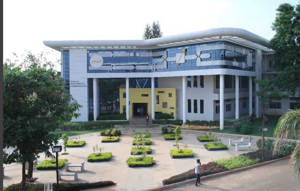
School of Electronics & Communication