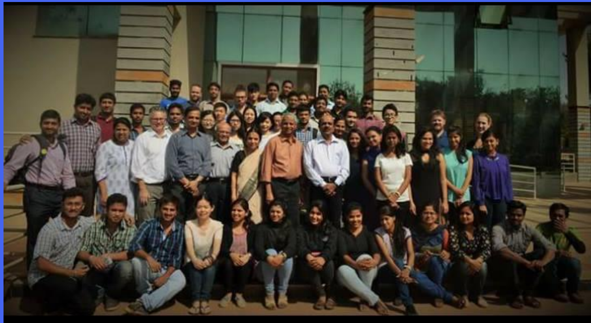
2016 Study Abroad Class