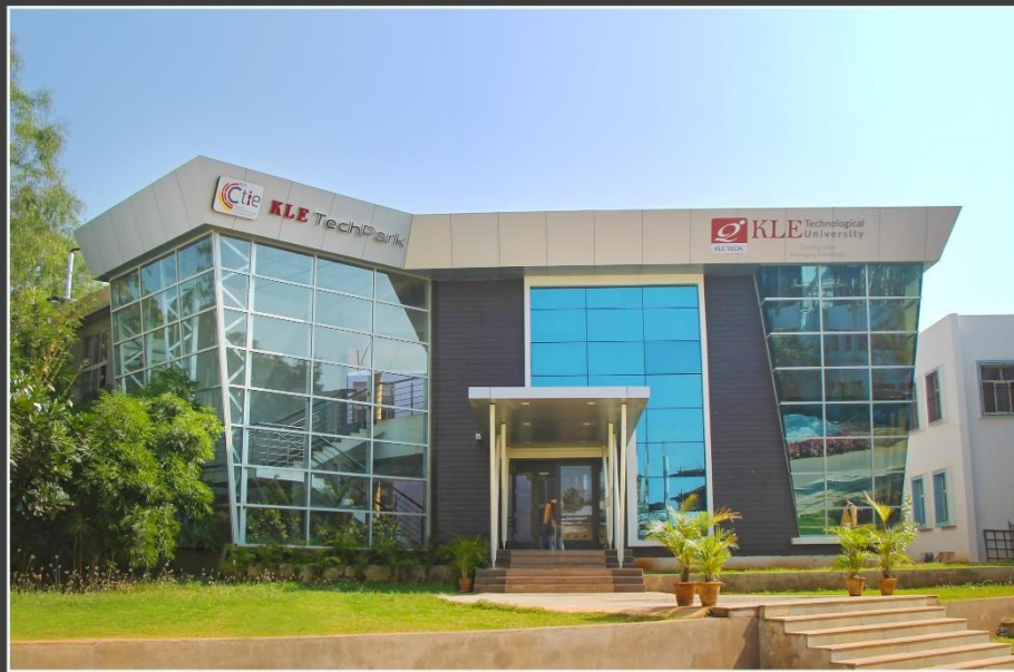
Center for Technological Innovation and Entrepreneurship Center